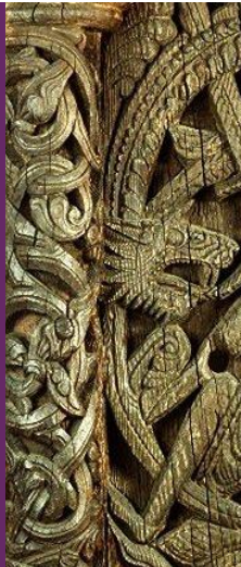
Door from a Norwegian Stave Church