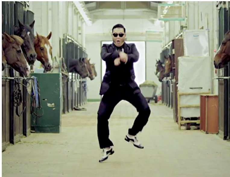
Figure 1: Gangnam Style